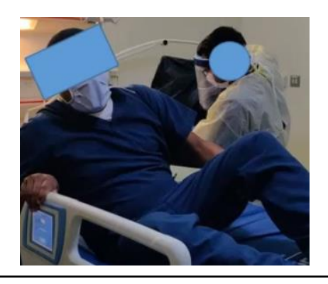
5. Placing detector behind the patient and sanitise the gloved hands