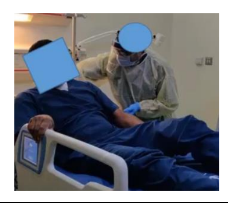
8. Take detector from patient, place sleeved detector on floor and sanitise the gloved hands