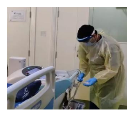
7. Step-out, then expose and check for adequacy of exposure