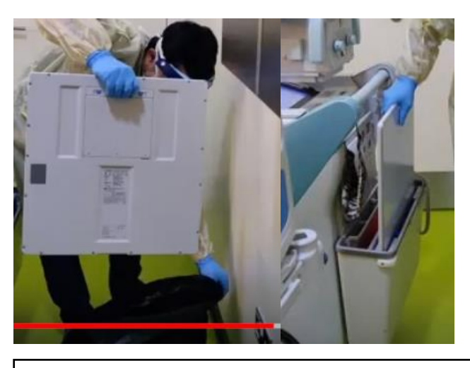
9. Remove detector from sleeve, place in machine's detector stand, discard the sleeve and sanitise the gloved hand