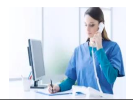
Confirm patient details on receiving request , Fix time, availability of staff, check downtime for portable CXR machine from log book